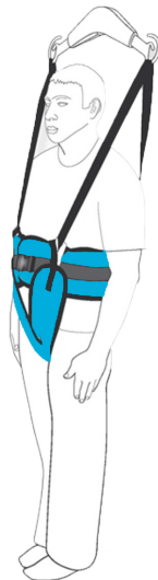
YOKE ATTACHMENT (SPREADER BAR)