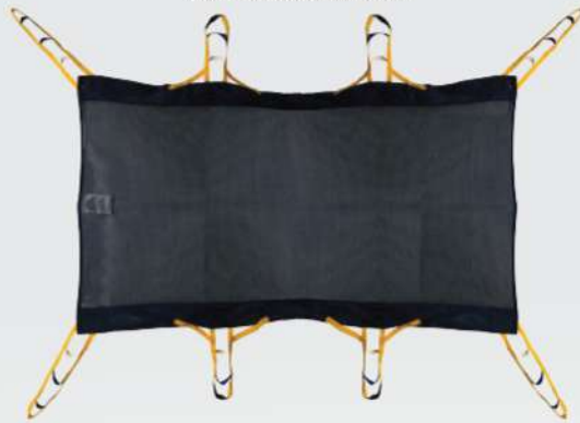
(Part Number 402508)